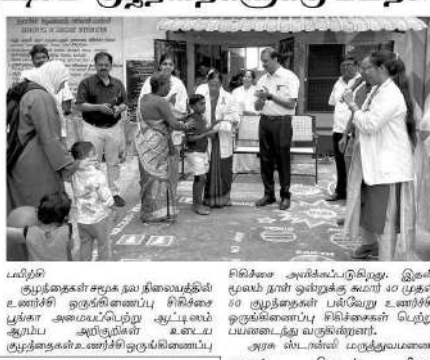
அரசு ஸ்டான்பின் மருத்துவமனையில் தினமும் 50 'ஆட்டிசம்' குழந்தைகளுக்கு பயிற்சி

சென்னை, ஏப்ரல் 03 - அரசு ஸ்டான்பின் மருத்துவமனையில் தினமும் 50 'ஆட்டிசம்' குழந்தைகளுக்கு பயிற்சி. சென்னை பெட்டிரோல் நிர்வாக இயக்குனராக எச்.சங்கர் பதவி ஏற்பு.