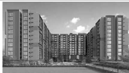
புதுயாக்கத்தில் தனது முதல் திட்டத்தை அறிமுகப்படுத்தியிருக்கிற காசா கிராண்ட் முதியோர் குடியிருப்பு

சென்னை, ஏப்ரல் 03 - தென்வந்தியூரில் முன்னணி கட்டுமான நிறுவனத்தை ஒத்திருக்க காசா கிராண்ட் முதியோர் குடியிருப்பு பரந்த வசதிகளை வழங்கும் வாய்க்கால வளங்களைக் கொண்டு வந்திருக்கிறது. இதுபோன்ற வசதிகளை வழங்கும் வாய்க்கால வளங்களைக் கொண்டு வந்திருக்கிறது. இதுபோன்ற வசதிகளை வழங்கும் வாய்க்கால வளங்களைக் கொண்டு வந்திருக்கிறது.