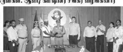
சுவட்ச இயந்திர வார்டி அருள் விளைவு